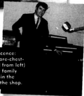
Days of innocence: (from top) bare-chested Joe (third from left) with Newent family and friends; in the RAF; and in the shop.